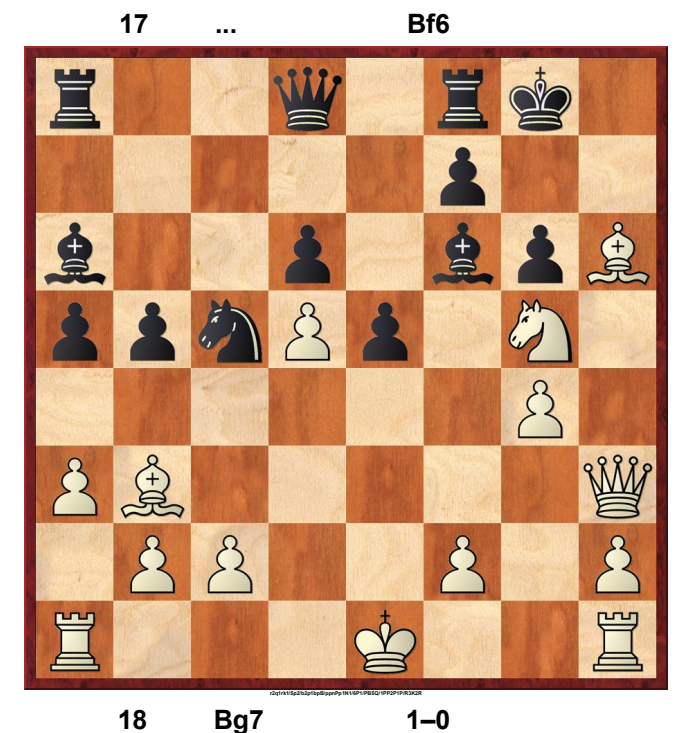
Website : www.newenglandchess.org.uk

White could continue 17 Nxc5 dxc5 18 Bxg7 Kxg7 19 0-0-0 with good prospects due to the passed pawn. Instead, he tries to land a lucky punch.