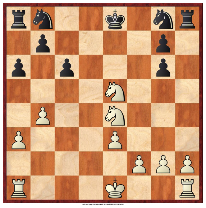
Compare the relative activity levels of the white and black knights!